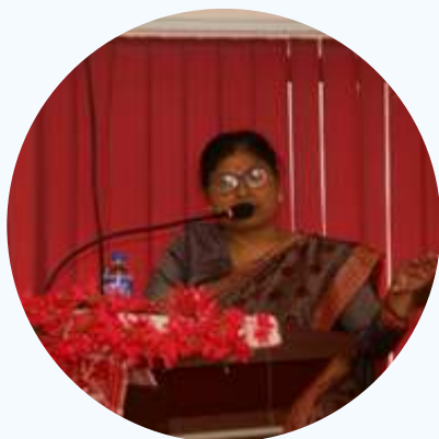
SPEAKER - 4