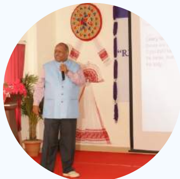
SPEAKER - 1