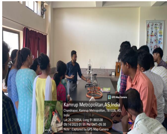
Figure: Pharmaceutical Chemistry Laboratory Visit