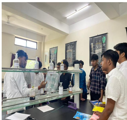
Figure: Pharmacognosy Laboratory Visit